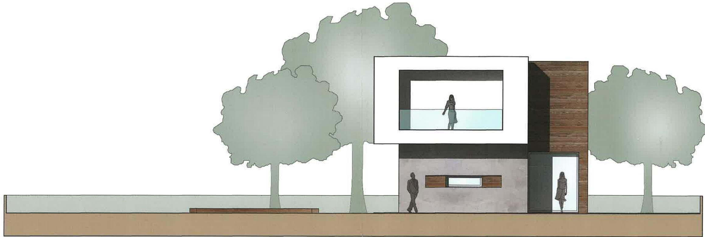
PROSPETTO EST - LATERALE